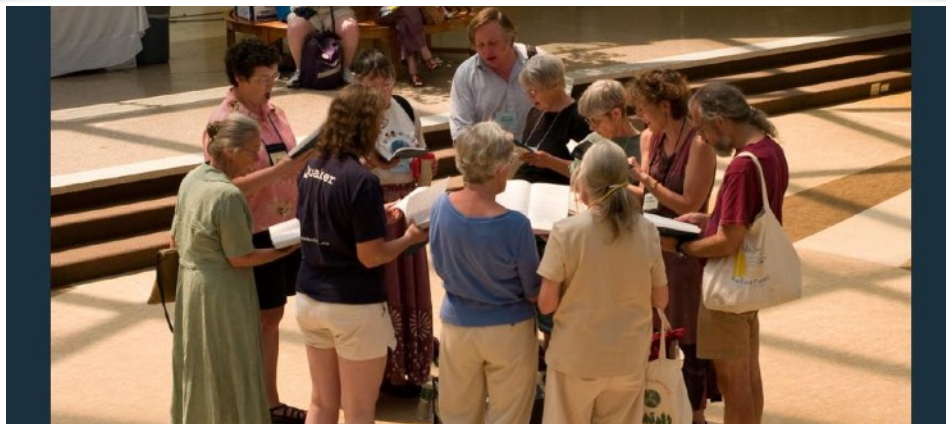
New England Quakers gathering in song at Sessions I