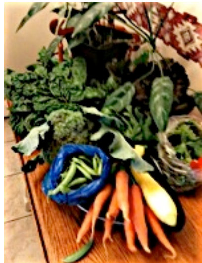
Summer bounty.