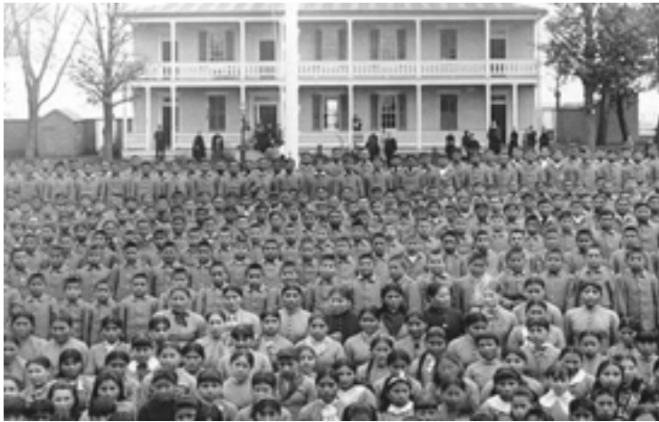
Carlisle Indian School, native children taken from their tribes