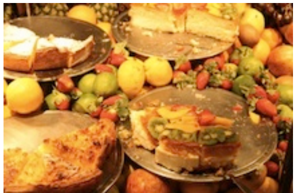
Artist's representation of no-pressure, all-dessert potluck. Actual potlucks may vary.