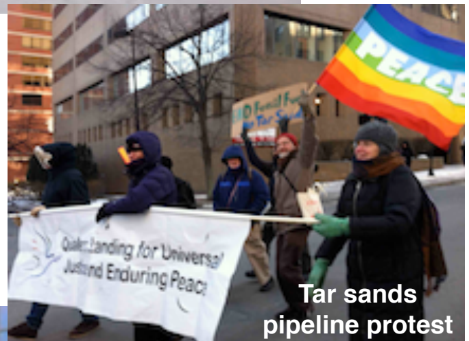
Tar sands pipeline protest