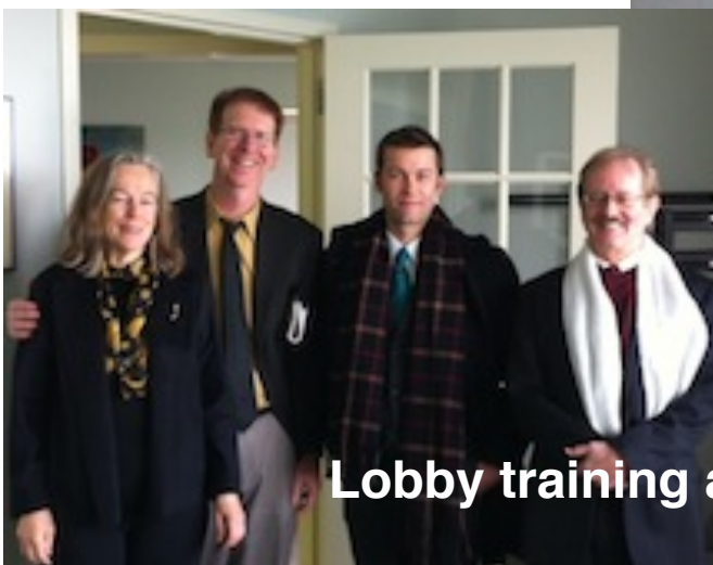
Lobby training and lobby day