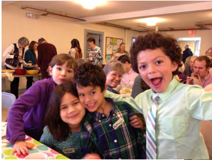
Easter Breakfast 2014