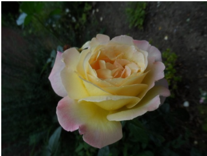
"Peace Rose," Portland Friends Meeting Peace Garden 9/11/14

"Tell me, what is it you plan to do with your one wild and precious life?"