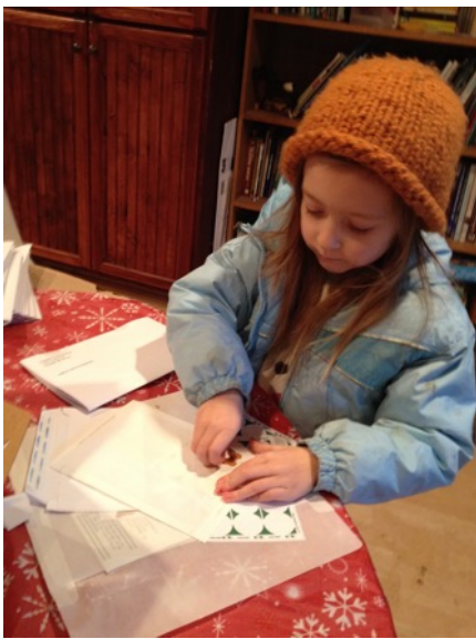
"This is my most favorite job!" says this sprightly newsletter mailing assistant, "When can I do it again?"