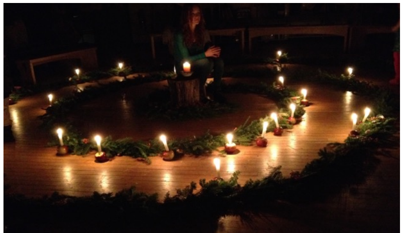
Spiral of Light, Friends School of Portland, December 5, 2014

4th Friday: 3:30-7p Preble Street Soup Kitchen Aaiyn Foster 766-9762