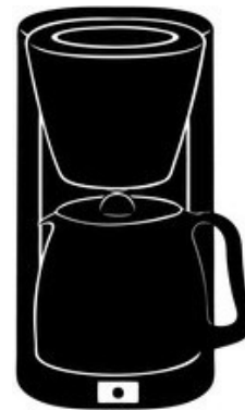
12 cup coffee maker still needed!