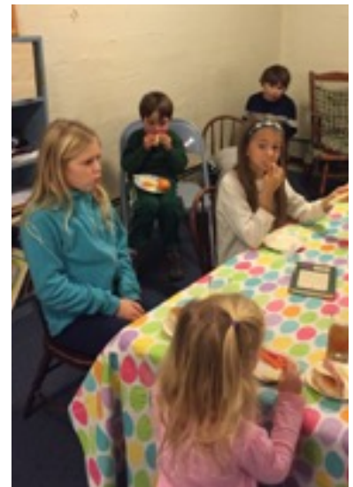
Advent Garden 2015