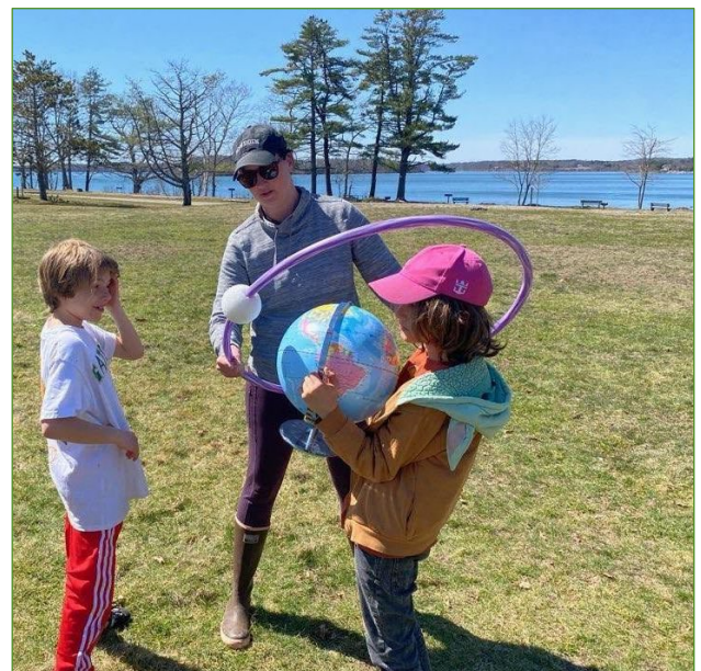
FSP Eclipse Day trip to Winslow Park to take in the sunshine while learning about the science behind the anticipated natural phenomenon!